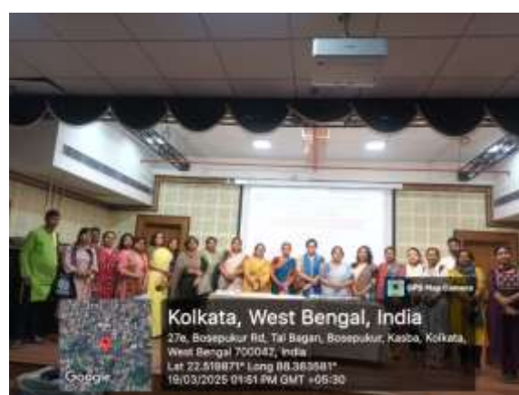
Group photo at the end of the seminar, with Principal, speakers, staff and students