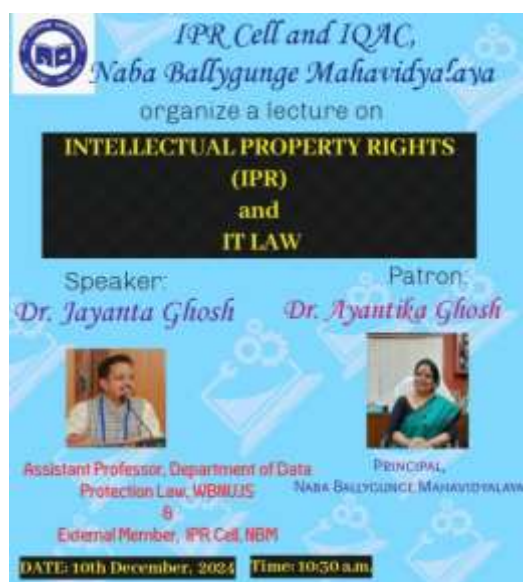
Flyer of the seminar Intellectual Property Rights and IT Law at Naba Ballygunge Mahavidyalaya on 10.12.2024