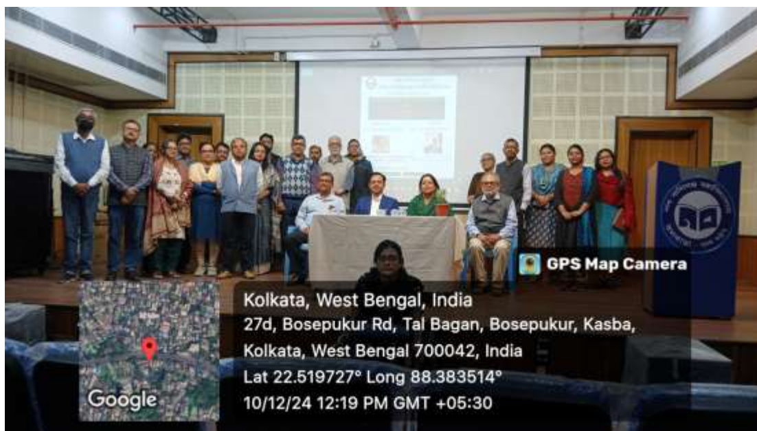
Group photo of Principal, Resource Person, IPR Cell Convenor, IQAC Coordinator and faculty members