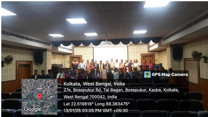
Group photo of Principal, Resource person, teachers and students at the end of the seminar