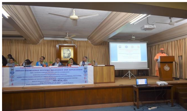
Inaugural address by Swami Supurnanda on Indian Knowledge Systems